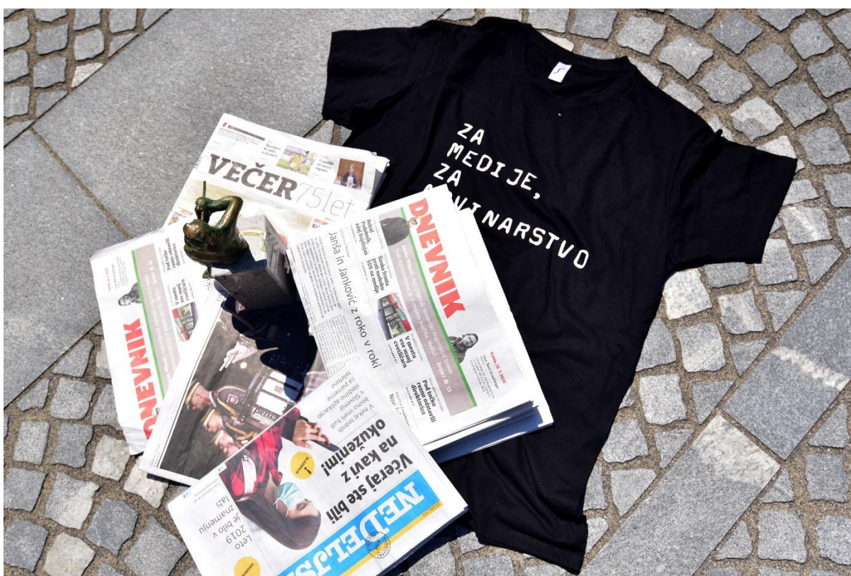
“For media, for journalism” Protest in Ljubljana; 15 July 2020.