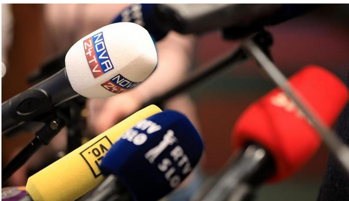
Slovenia press conference microphone.

commercial radio stations. During the mission, Radio Študent said the loss of its EUR 100,000 financing had left them facing restructuring and staffing cuts. The outlet has launched a lawsuit against the Ministry, alleging that the decision was politically motivated and aimed at stifling its critical coverage of the government. Ministry of Culture officials said the fund's allocation was aimed at fostering greater diversity in an unbiased market. However, numerous stakeholders raised concerns over the narrowness of the selection criteria and the system of appointment of the commission, which is chosen by the Minister of Culture. It was noted a majority of the current commission have links or affiliations with the government. During the mission, representatives from the Ministry said that during the pandemic the government allocated tens of millions of euros for Covid-19 relief aid to the media.