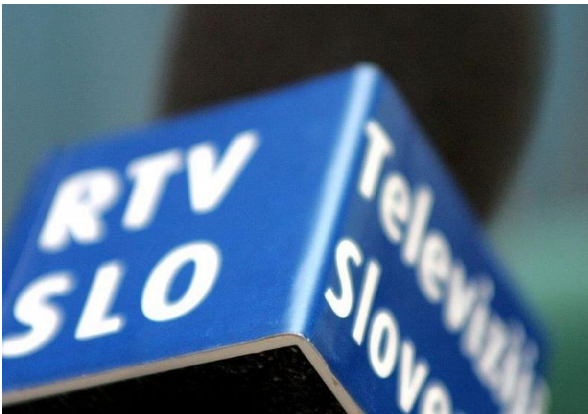
RTV SLO