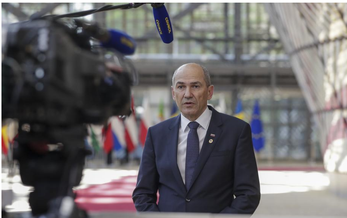
Slovenia's Prime Minister Janez Janša.

One of the defining features of the current government in terms of media freedom has been the aggressive use of social media by public officials and the executive office to denounce critics. Since returning to office, the PM has continued to use Twitter to insult and demean journalists he disagrees with on a regular basis, lambasting critics as “liars” and propagators of “fake news”. As well as journalists from public service media, privately-owned media have been accused by the PM of “persistently lying” about the pandemic and, in so doing, contributing to the death toll. Official government communication channels have also been misused to amplify this unfounded criticism. Other officials have threatened journalists and joined calls for citizens to publicly denounce so-called “media manipulators” spreading false information. While many of these Twitter jabs have been aimed at journalists from liberal newspapers such as Mladina and Delo – media long criticised by the PM - a range of foreign media have been similarly targeted including ARD, DW, Der Spiegel, Der Standard, Politico and The New York Times. This hostile rhetoric and direct confrontation with journalists has been condemned by newspapers’ editorial boards and even in joint statements by academics and 22 of the country’s leading editors-in-chief.