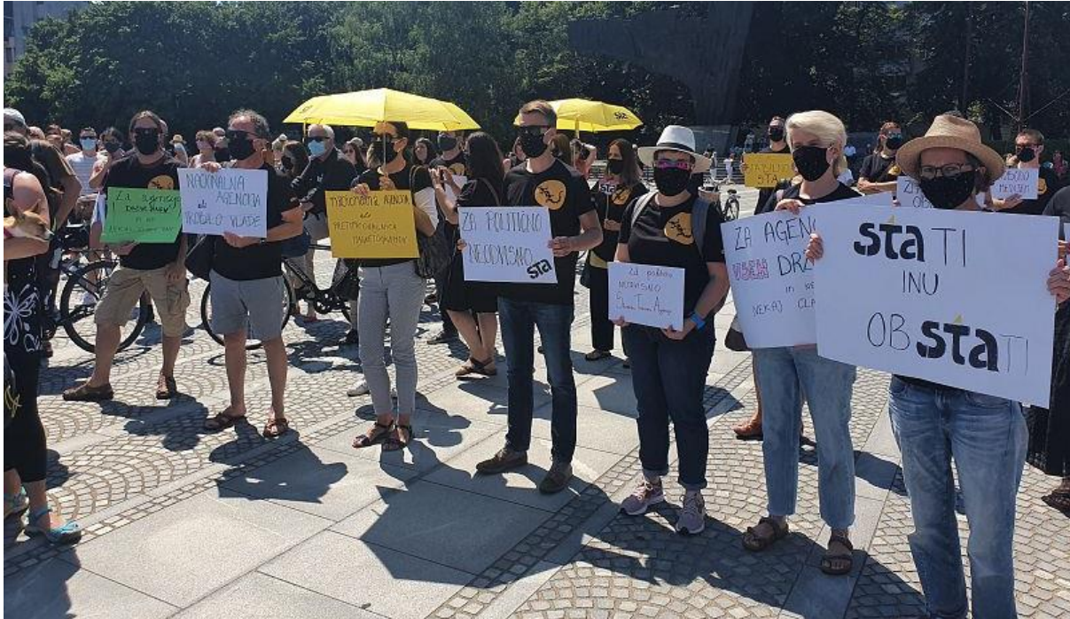
Protest in Ljubljana over STA funding suspension; July 2020.